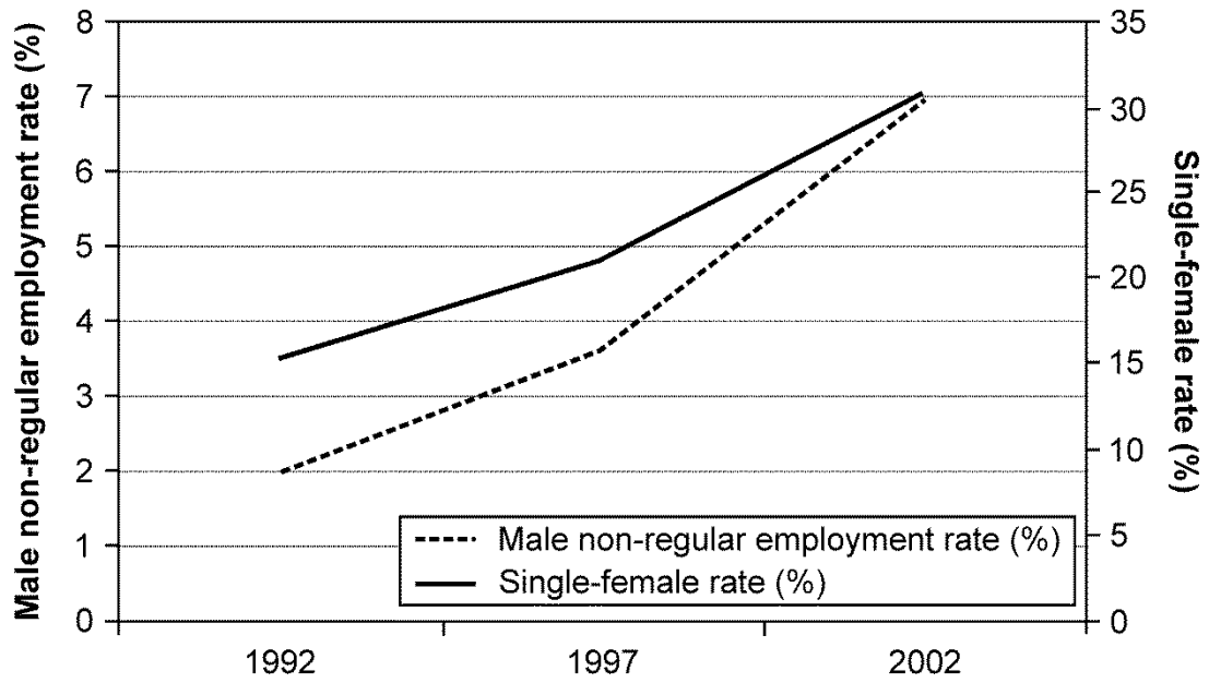
Fig.2. Trends of the single-female rate and the male non-regular employment rate.